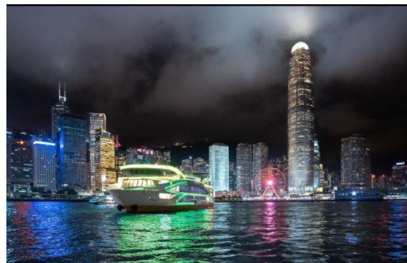
Get on the Victoria Harbor Cruise Trip Banquet!