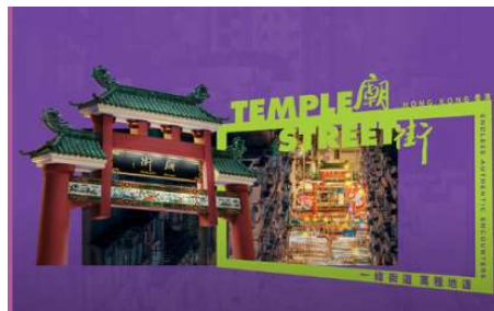
And many more to explore!