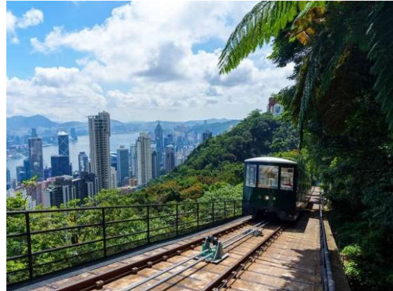
Gaze across Hong Kong and Kowloon from The Peak