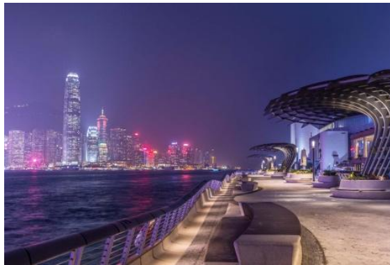
Take in the Hong Kong skyline from all angles