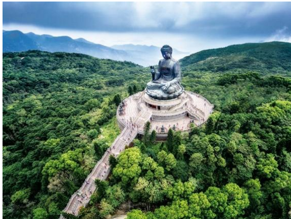
Climb the steps up to the Big Buddha