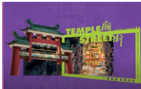
And many more to explore!