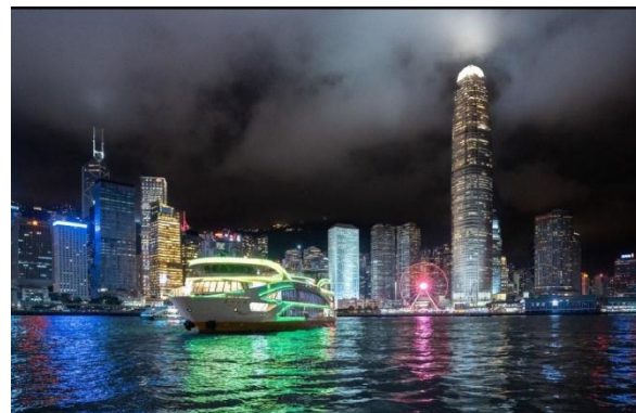
Get on the Victoria Harbor Boat Trip!